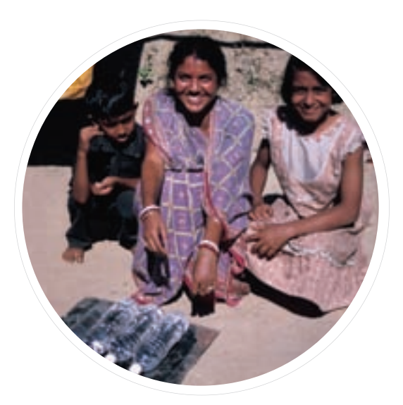
Using solar disinfection (SODIS) in Nepal

8. Turbidities higher than 30 Nephelometric Turbidity Units.