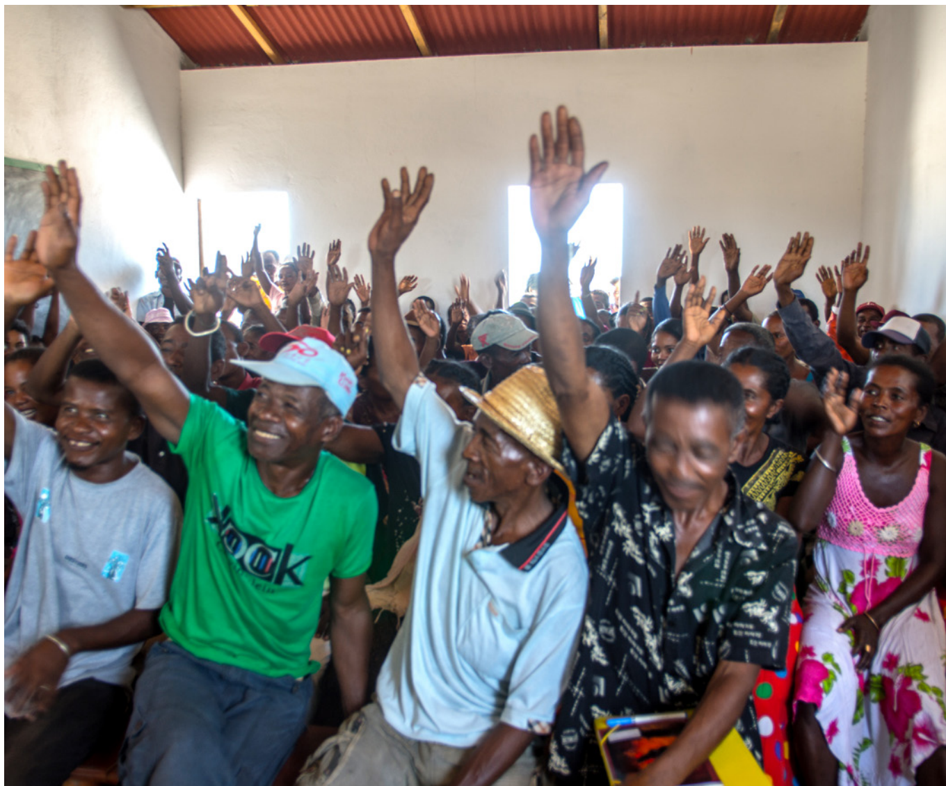
Triggering local and traditional leaders together with community health workers

In the three regions where previously CLTS had failed to achieve behavior change, entire communes are now becoming ODF. Following the introduction of the Social Norms Approach, more than 56,000 latrines were constructed in only 15 months, as households abandoned open defecation. In May 2015 the Minister of Water, Sanitation and Hygiene celebrated the achievement of the first four ODF communes in Madagascar (with a population of more than 80,000 people) in Androy Region. During the ceremony, traditional and administrative leaders were given green flags by the Minister to indicate that their respective villages are now ODF and clean villages.