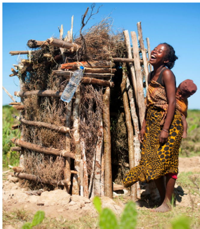
Woman happily showing off her latrine in southern Madagascar

Madagascar is one of the poorest countries in the world, ranking 157/186; over 72 per cent of households, and thereby 82 per cent of children, live below the poverty line (UNDP Human Development Report, 2014). The under-five mortality rate stands at 62/1,000, of which 48/1,000 die under the age of one. The main causes for child mortality are pneumonia, diarrhoea and malaria. Over 47 per cent of children in Madagascar are stunted – a rate that is among the highest in the world (UNICEF MICS Report, 2012).