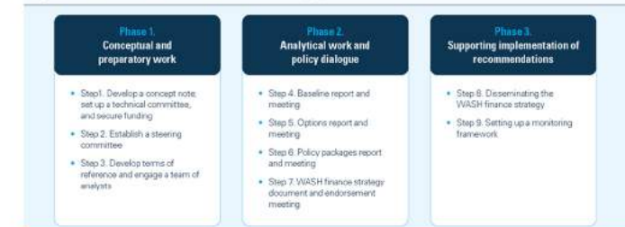
Figure C. Phases of the WASH finance strategy process

It is important to identify the window(s) of opportunity that may favour the initiation of a WASH finance strategy, most importantly integration with and building on government policy and budget processes. If a country is not ready for a full WASH finance strategy, it is worth considering a phased or modular approach, picking low-hanging fruit and building support for a full finance strategy.