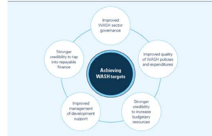
Figure B. Benefits of developing a WASH finance strategy