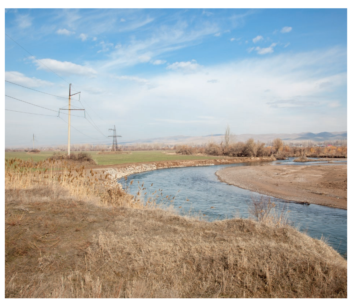
Transboundary Chu River between Kyrgyzstan and Kazakhstan.

http://assets.panda.org/downloads/ratification_justification_netherlands_1.pdf)