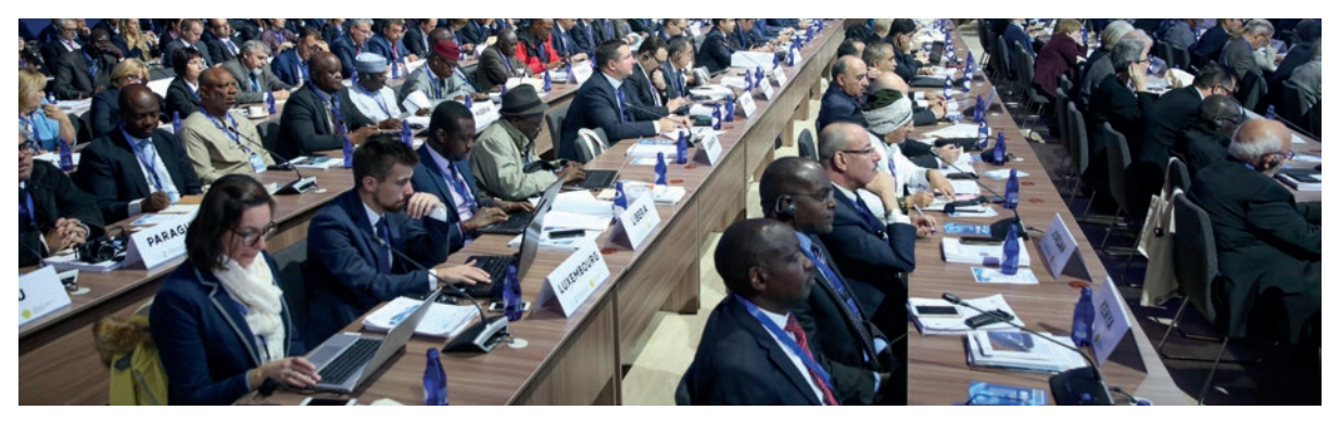
8th session of the Meeting of the Parties to the Water Convention (Nur-Sultan, 10th-12th October 2018)

Central features of the institutional framework include the triennial sessions of the Meeting of the Parties, the Secretariat which is provided by the United Nations Economic Commission for Europe, working groups and task forces, and the Implementation Committee. Each of these bodies support the implementation and development of the Convention. For example, every three years the Meeting of the Parties agrees on a programme of work, which provides the means