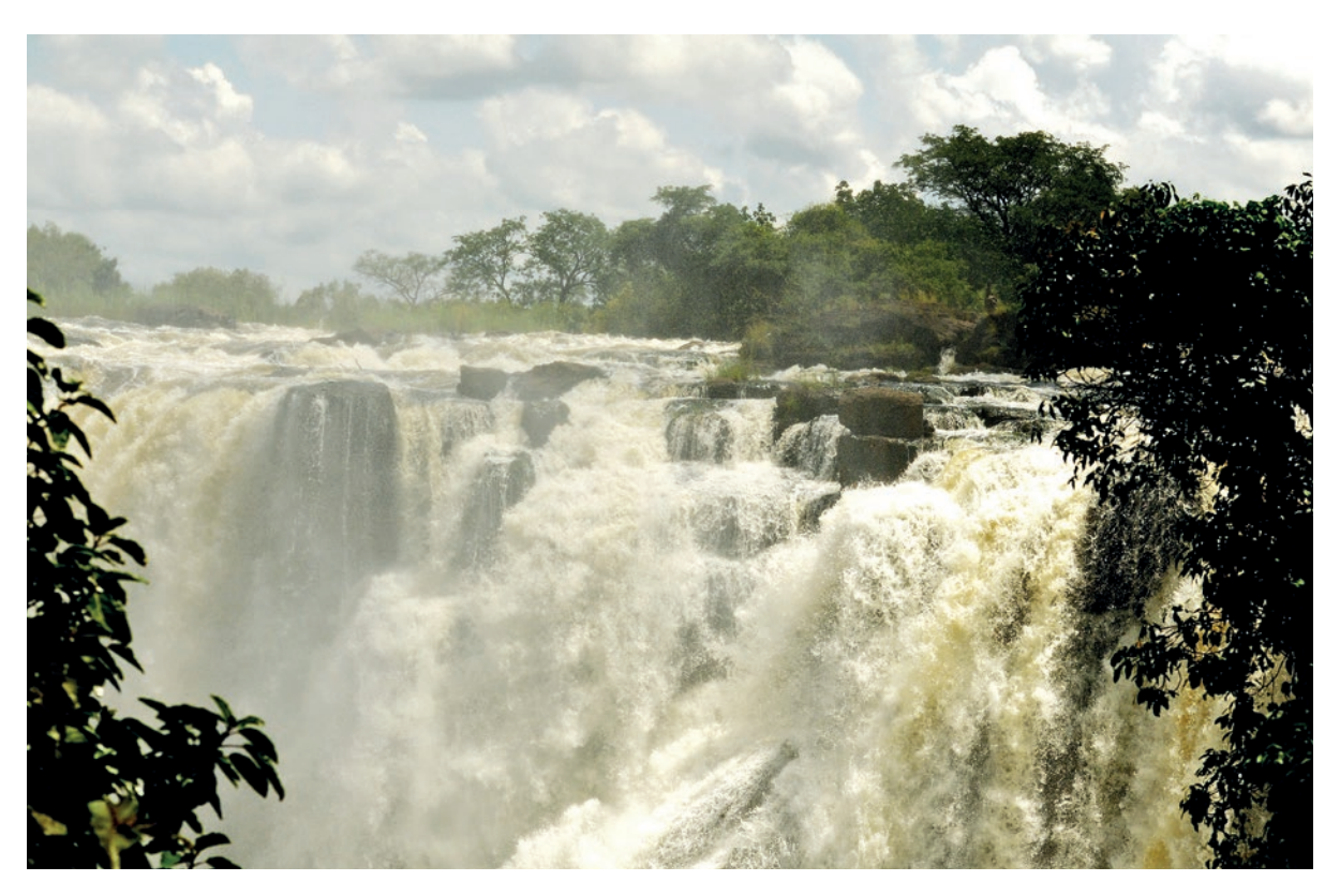
Victoria Falls straddles the border between Zambia and Zimbabwe.

These high-level calls to accede to and implement both United Nations global water conventions reflect a growing support for the two instruments, which in turn has resulted in experts from government, international organizations, NGOs and academia raising an increasing number of questions concerning the role and relevance of the two conventions.