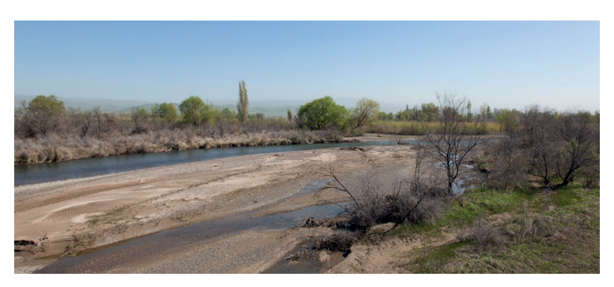
Transboundary Chu River between Kyrgyzstan and Kazakhstan.

agreements and can support countries in the negotiation of new or revised cooperative arrangements. Through institutional frameworks such as that offered by the Water Convention (described below), they also assist countries in the implementation of basin agreements to address growing water challenges and thereby promote sustainable development and peace. As the first report on the implementation of the Water Convention illustrated (UNECE, 2018), in about 25 years, the Water Convention has significantly driven cooperation among its Parties which have developed agreements and established institutions on their shared waters. For example, in the Dniester River basin, which is shared by Moldova and Ukraine, the Water Convention directly supported the negotiation and ratification of a bilateral treaty in 2012 which is based on the two global United Nations water conventions. The Commission on Sustainable Use and Protection of the Dniester River Basin (the Dniester Commission) established by the two countries to jointly manage the Dniester River basin is an important outcome of this treaty. The Dniester Commission held its first meeting in September 2018.