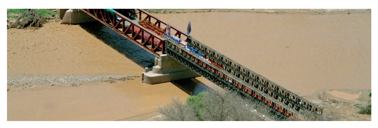
An aerial view of the Mereb Bridge on the day of the reopening ceremonies, which recreated a physical link between Ethiopia and Eritrea.

Thirdly, in order to put the aforementioned obligations into practice, the Convention requires Parties to conclude transboundary agreements and set up joint bodies, such as river or lake basin or aquifer commissions, to cooperate on the management and protection of their transboundary waters. Procedures for settling disputes in a peaceful manner are also provided for in the Water Convention.