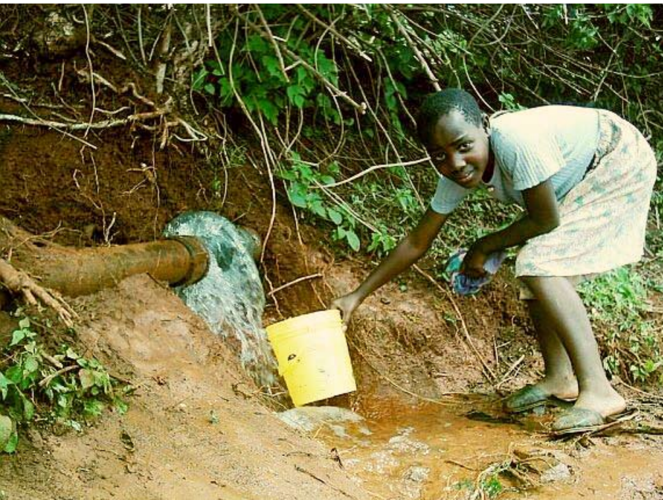
A girl fetching water from a leaking pipe.