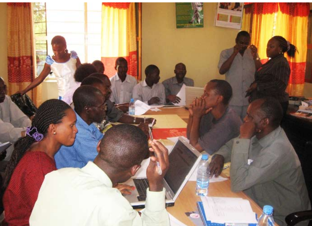
A meeting convened to set up operational procedures.