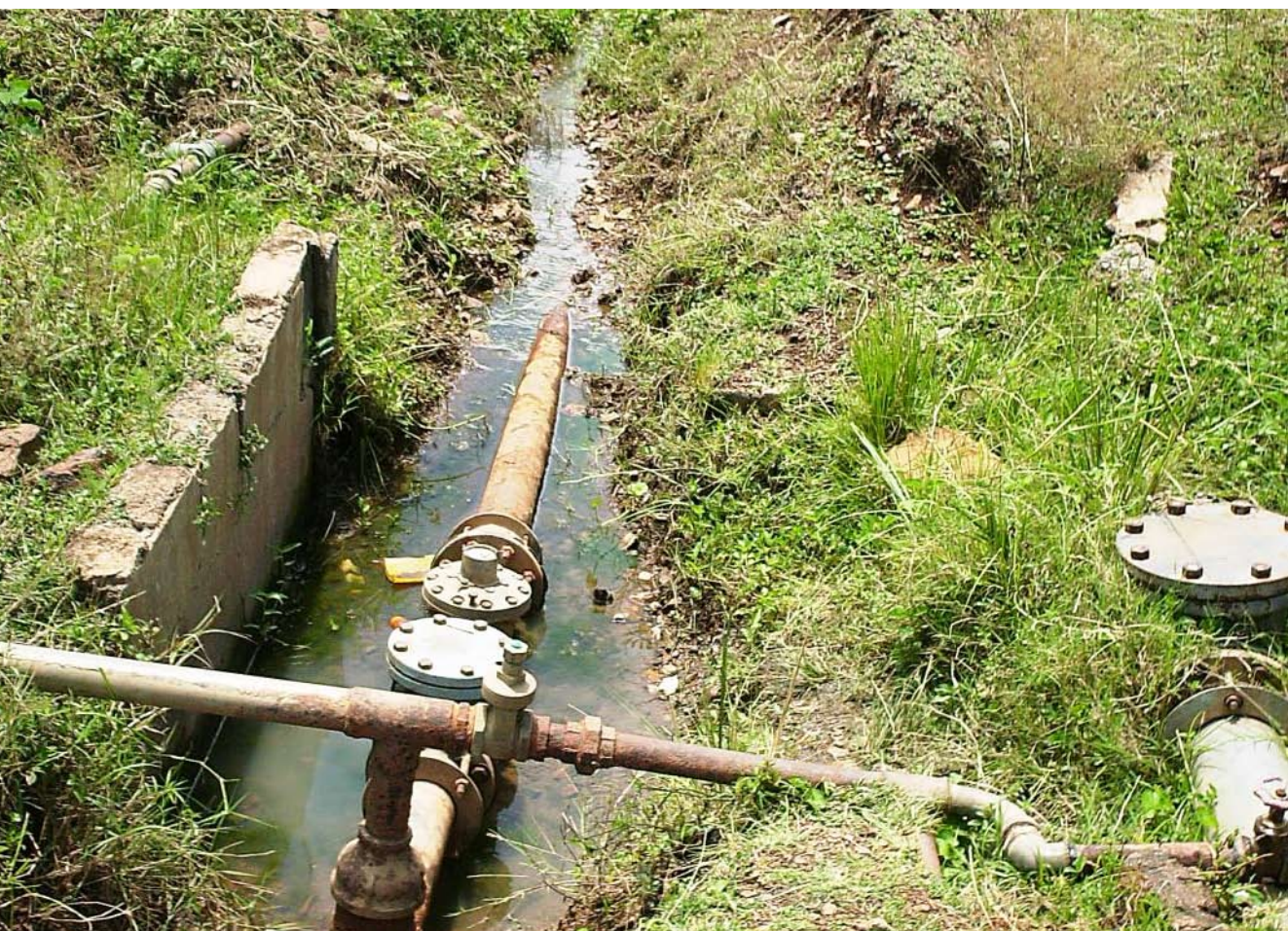
A leaking pipe.