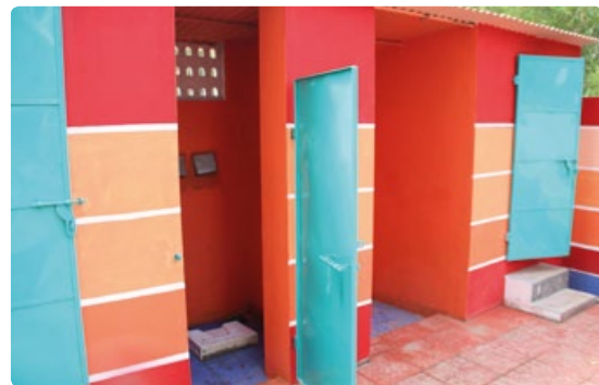
Top left: Adolescent school girls content with their new toilets. Top right: Newly built sanitation facility for girls with a large number of urinals and a few closed cubicles. Below right: Closed toilets and wash rooms with urinals for older students.