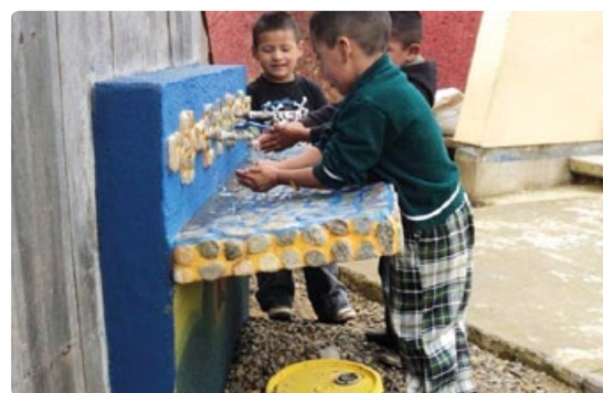
Top left: Local dishwashing practices were considered for the design and construction of this greywater treatment station which begins with solid & grease traps; main treatment is in saturated biofilter, which discharges for irrigation reuse into existing school garden. Top right: SARAR participatory methodology workshops allow for active involvement of the school communities. Below right: A robust concrete handwashing facility was installed at proper height for small users, located just beside existing kitchen. Hygiene & handwashing workshops reinforce behavior change.