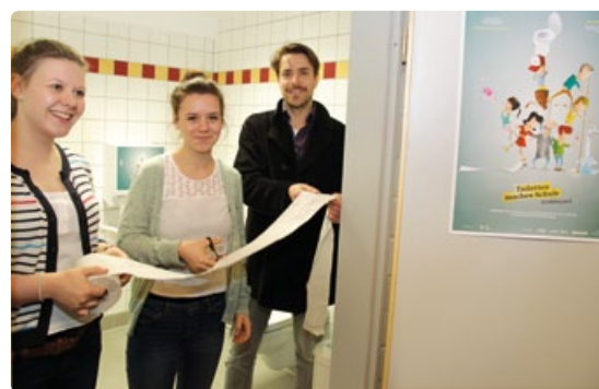
Top left: "Toiletten machen Schule" award ceremony with the winning schools in Berlin. Top right: Art project in one of the participating schools. Below right: Inauguration ceremony of the new school facilities.