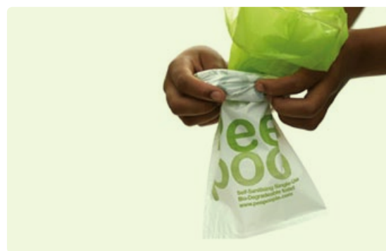
Top left: Children standing in line at Peepoo cabins. Top right: The Peepoo toilet. Below right: Peepoo Dubu training material for school children.