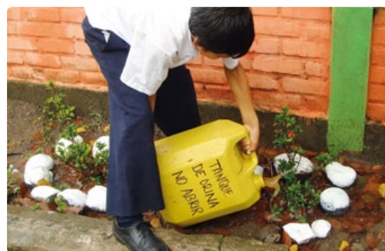
Top left: Children drawing during a hygiene-education exercise. Top right: Teachers and community members are introduced to the new sanitation facility. Below right: Stored urine is applied to flowers to demonstrate the usefulness as fertiliser.