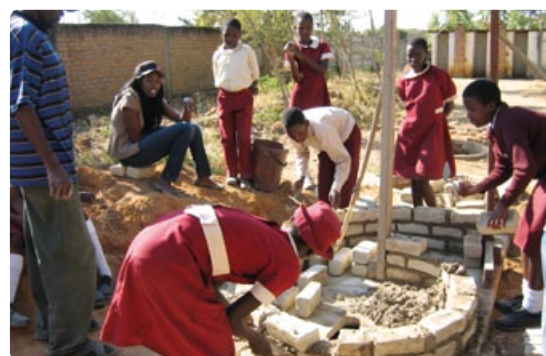
Top left: A completed spiral Blair VIP built by the school girls. Top right: A young gum tree being watered with diluted urine in a school woodlot. Below right: An earlier stage of construction of the spiral Blair VIP.