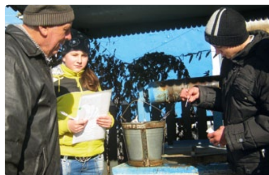
Top left: River cleaning activities in district Drochia Top right: First toilet for a family type home for vulnerable children in Northern Moldova. A happy boy. Below right: Testing the water quality of the wells in Zgutita, Drochia.