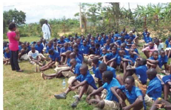
Top left: new handwash facilities are demonstrated during a bigger event. Top right: Urine storage is being well documented to ensure safe reuse of urine in agriculture. Below right: Hygiene education event.