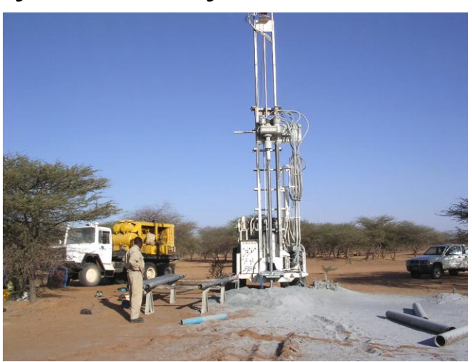
Figure 3: Water Well Drilling in Burkina Faso

From a social and economic perspective it is an advantage to the country when the know-how and revenues from drilling remain in the country. Exchange of experiences, for example could be coordinated by a drillers association.