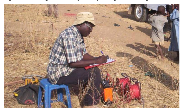
Figure 3: Siting - Resistivity Survey in Niger State, Nigeria

In some cases siting is undertaken by a consultant, who may also supervise the drilling. In many countries, the drilling contractor is expected to site the well, and is shouldered with the blame if it is dry, i.e. "no water no pay". The driller and the community may be expected to locate two or three suitable sites within a particular village, in order of preference.