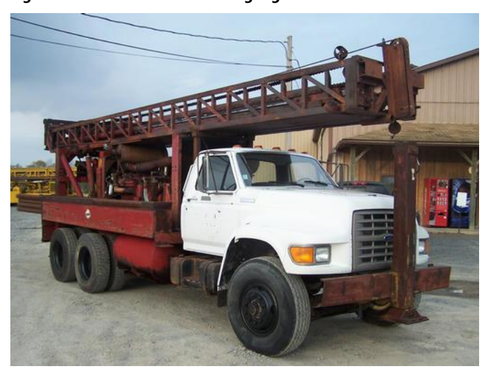
Figure 1: Schramm-T6HB Drilling Rig

This field note is based on available information, and tools, discussions with drillers and analysis of drilling costs. We sincerely hope that it can assist drilling enterprises to realistically calculate their costs, determine competitive prices and thus flourish! It should also be of assistance to agencies as they design tender documents.