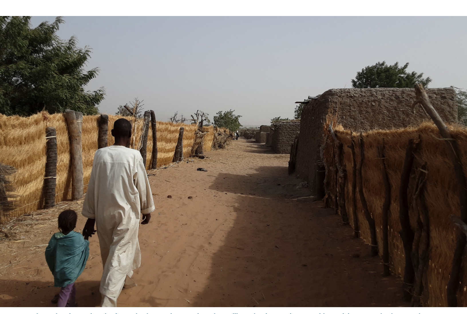
Assessing the market size for sanitation produces and services will require data on demographics and data on sanitation practices.