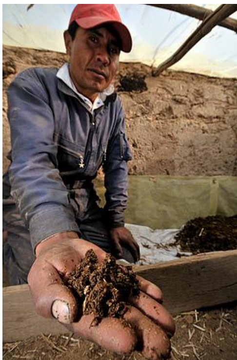
Figure 1: Composting in Colquenchá, Bolivia.

Particularly in warm climates organic waste tends to begin decomposing quickly -- within a day or so. Rotting organic waste is often responsible for the foul smell in bins, vehicles and