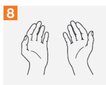
Once dry, your hands are safe.