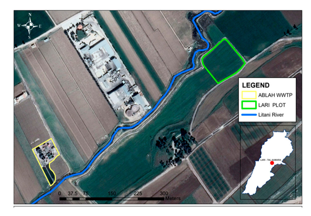
Figure 1. Location of the experimental field showing irrigation resources: Ablah Waste Water Treatment Plant and the Litani River.

water source in the Bekaa Valley (Figure 1). The soil at the experimental trial site has a sandy loam texture, a pH with a mean value of 7.23 \pm 0.15 , electrical conductivity of 0.016 \pm 0.02 \text{ dS} \cdot \text{m}^{-1} , and organic matter content of 1.55\% \pm 0.30\% .