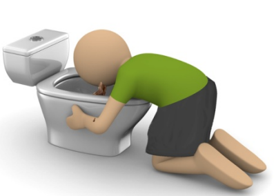
Vomiting May contain blood