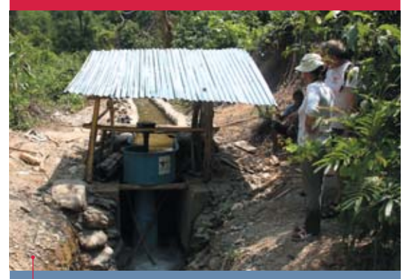
1,000W pico hydro turbine

A pico-turbine is an assembly comprising a hydraulic turbine or propeller and a 220V single-phase alternator with a permanent magnet. The word "Pico" indicates the alternator's range of power. There are three types of hydraulic turbine: Run of the river Kaplan (vertical pico hydro turbine) or Francis turbine (horizontal pico hydro turbine), and Pelton waterwheel for the high heads ("seated" pico hydro turbine).