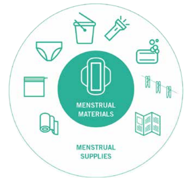
Figure 2 Beyond pads: the range of supplies needed by girls and women