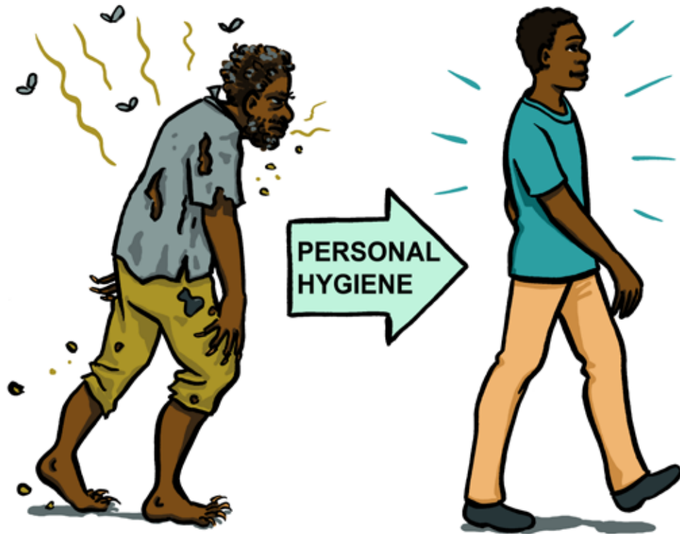
Figure 4. Good personal hygiene practices can improve your self esteem.