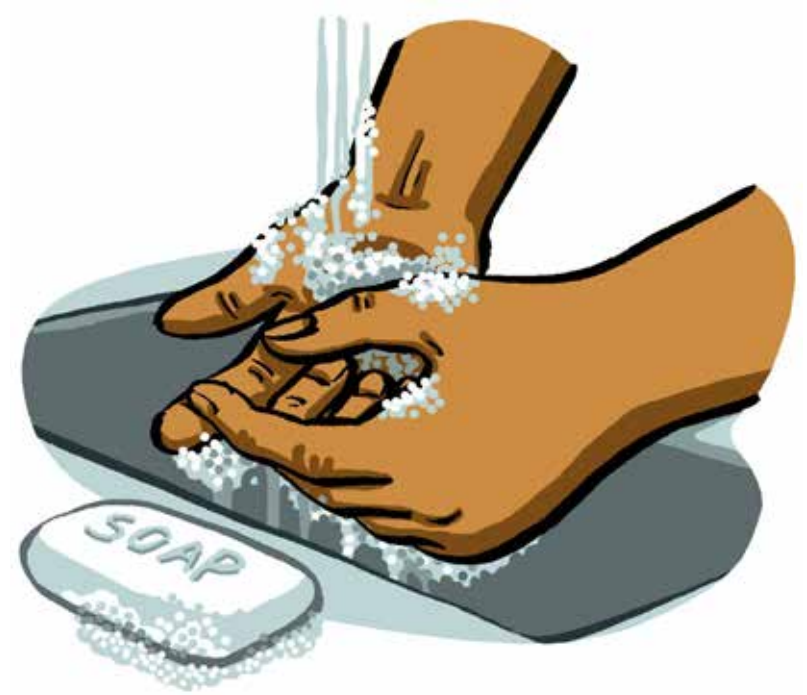
Figure 1. Always remember to wash your hands with soap.

Hygiene refers to conditions and practices that help to maintain good health and prevent the spread of diseases. Good hygiene is also often referred to as “cleanliness”. Bad hygiene practises and improper sanitation are one of the main reasons for diseases spreading in the communities. Improvements in hygiene practices, access to proper sanitation, water and washing facilities will reduce child mortality, lethal infections, illnesses and malnutrition. When people stay healthy, they can also work and go to school as well as participate in the community activities.