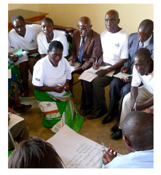
Above: Workshops like this one in Mzuzu, Malawi, are an opportunity for Federation members to engage with local government officials and traditional authorities.

How do land tenure issues affect sanitation provision for the urban poor?