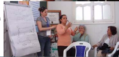
Field visit to GDA of Oued Sbayhiya and Jradou Zaghouan, Tunisia