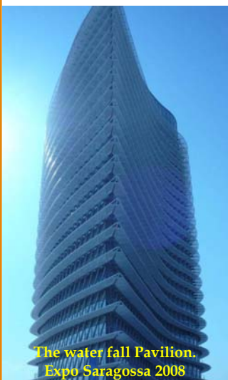
The water fall Pavilion. Expo Saragossa 2008