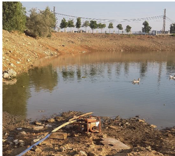
Figure 2. Illegal pumping of water from rivers in Lebanon, a common observation.