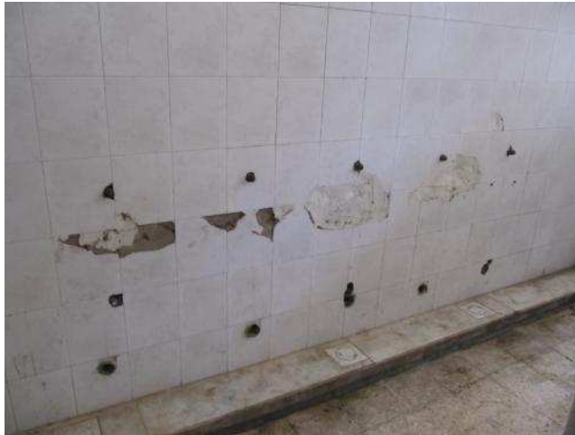
Wash basins to be maintained