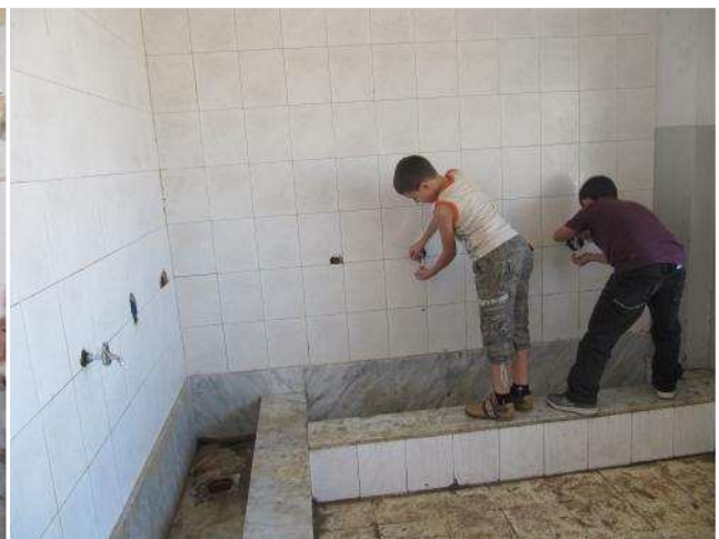
Inadequate drinking facilities