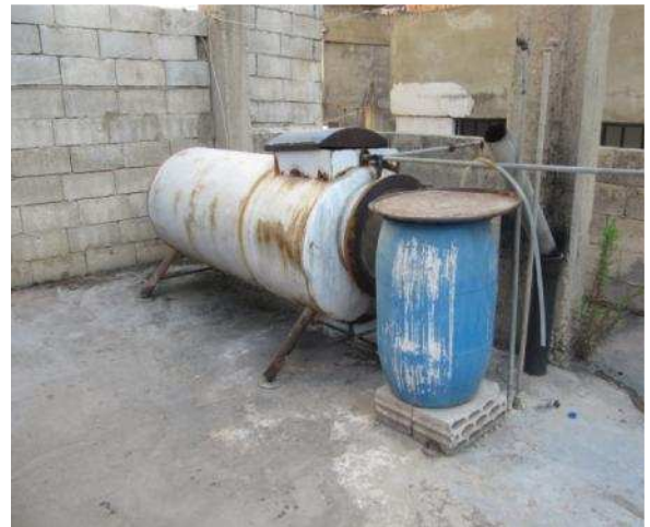
Inadequate storage facilities