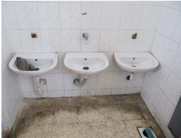
Wash basins to be maintained