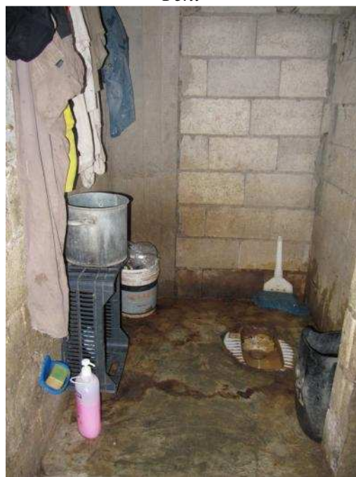
Toilet to be maintained