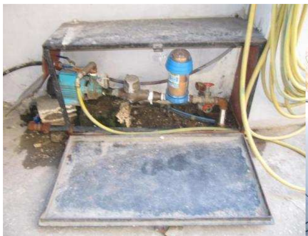
Cartridge filter for potable water