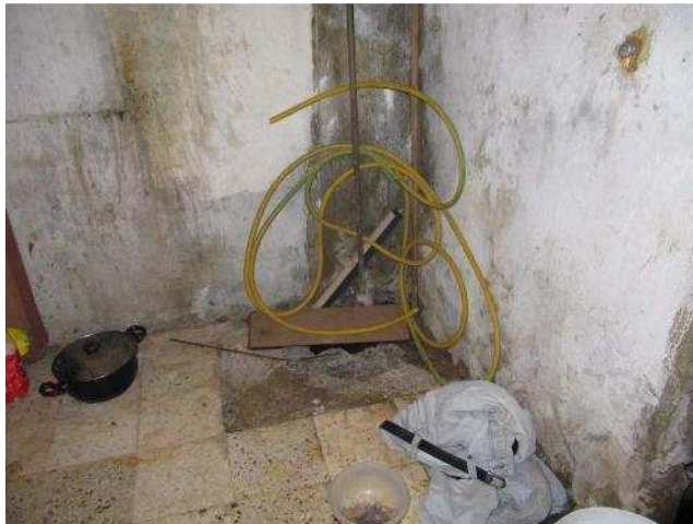
Manhole to be installed