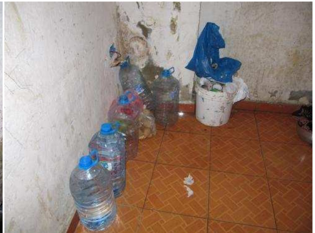
Inadequate storage facilities