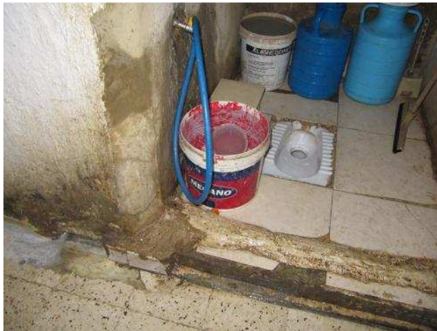
Toilet to be maintained