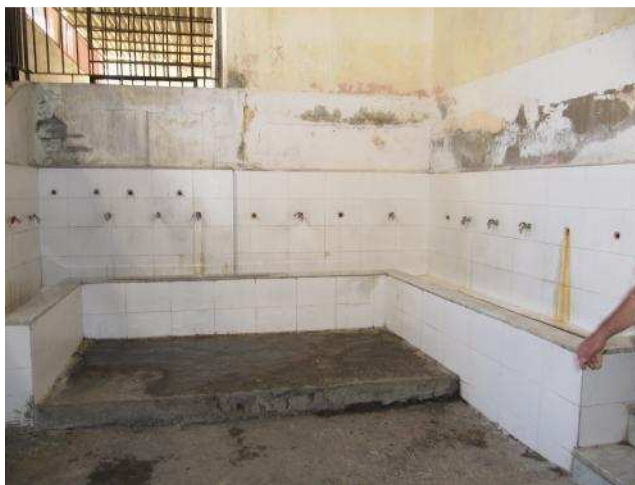
Drinking facility to be maintained