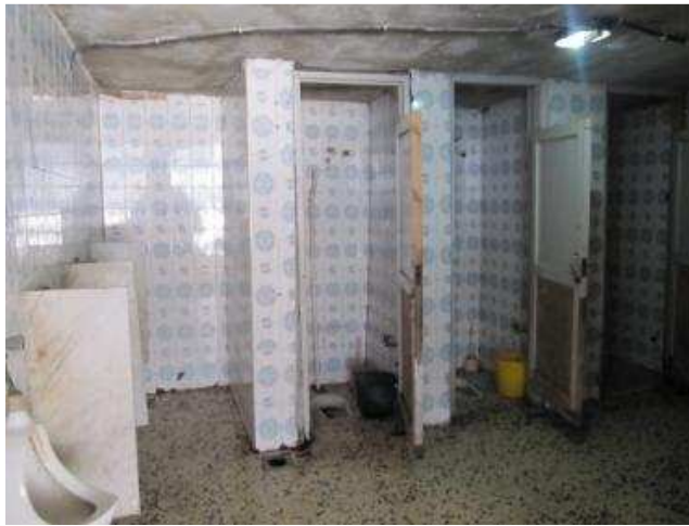
Toilets to be maintained