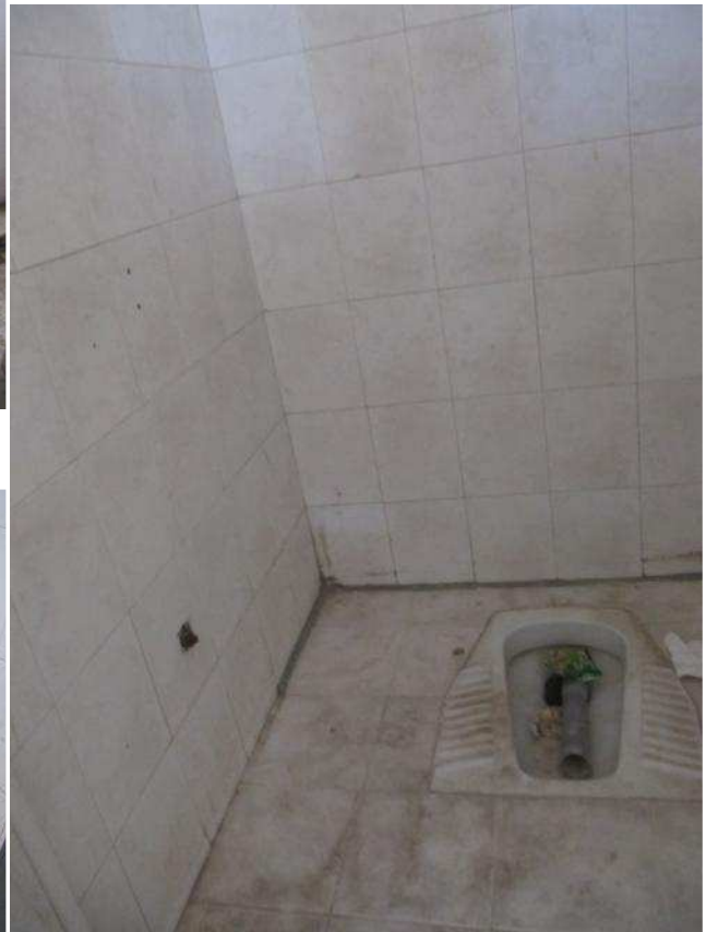
Toilets to be maintained