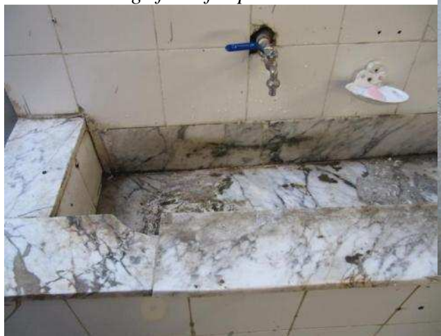
Drinking facility to be maintained