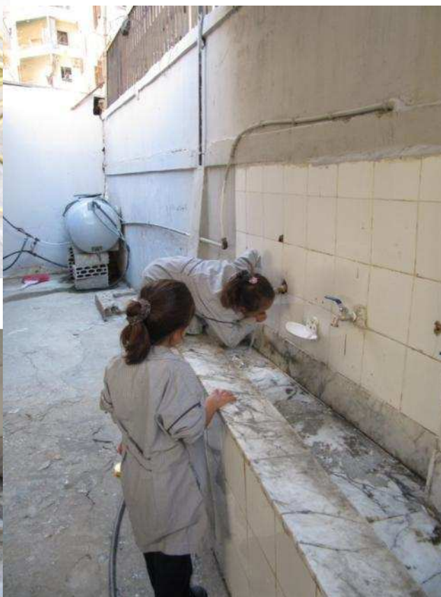
Inadequate drinking facilities