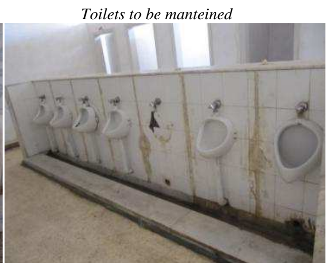
Toilets to be maintained