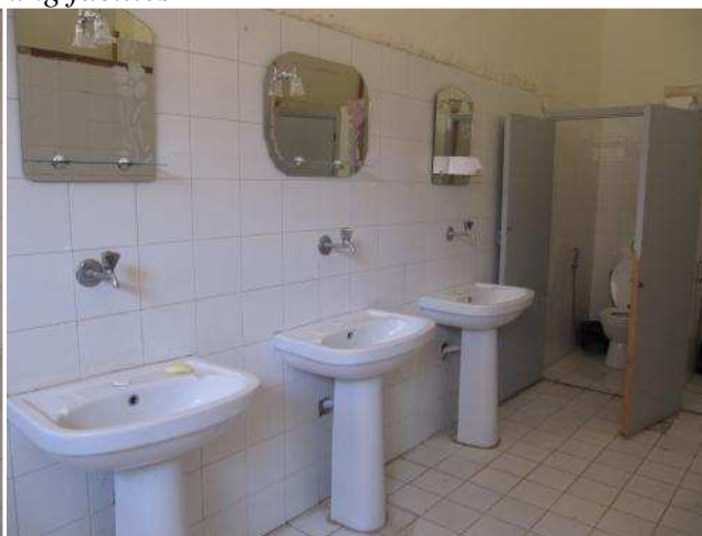
Adequate wash basins