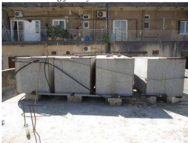
Water tanks to be replaced