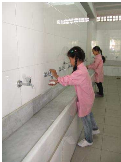
Adequate Wash basins