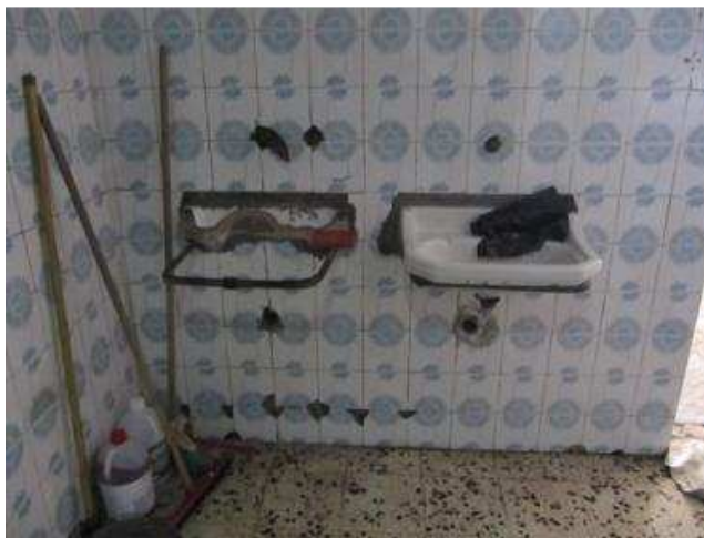
Wash basins to be maintained