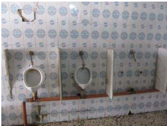
Urinals to be maintained