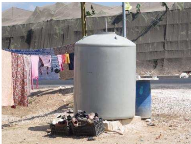
Shared water tank