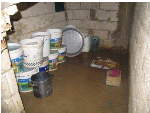
Toilet to be maintained