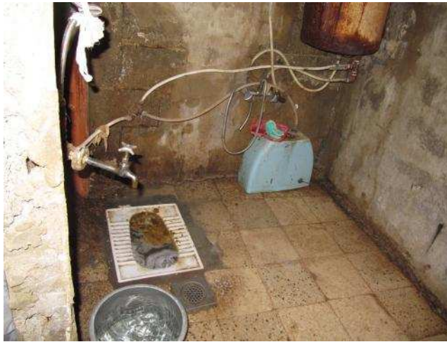
Toilet to be maintained