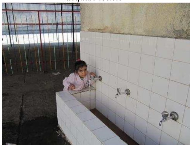
Adequate drinking facilities