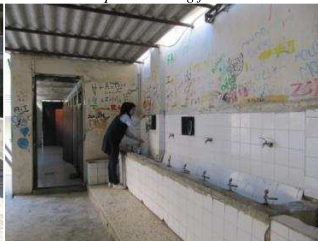
Drinking facility to be maintained