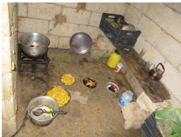
Space for promiscuos use to be maintained