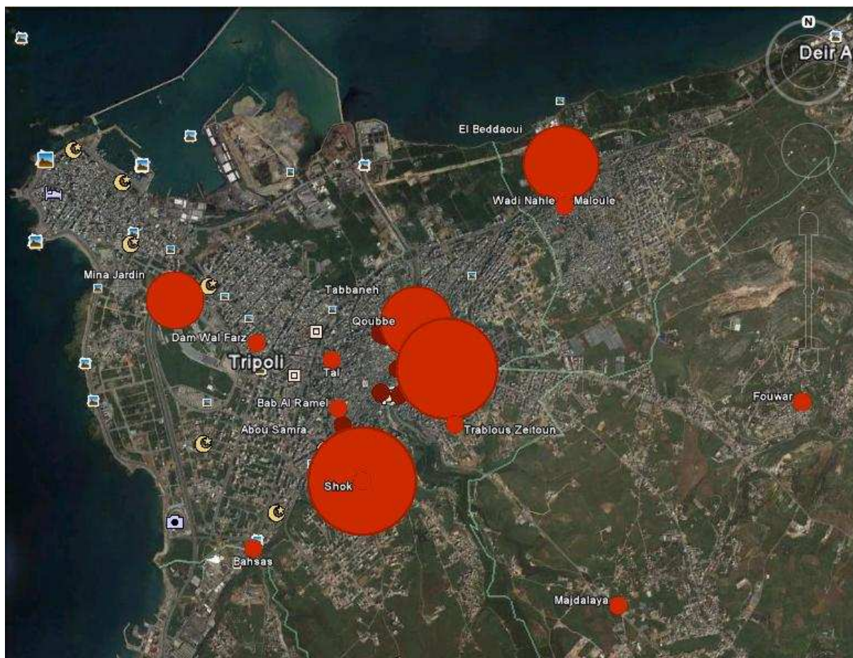
North Lebanon – Tripoli and Beddawi areas

Based on the existing gaps in geographic coverage in response to emergency WASH needs, and per recommendations by UNHCR and UNICEF, CISP-RI selected to assess two areas in North Lebanon: Beddawi and Tripoli (Greater Tripoli), and two areas in South Lebanon: Tyre and Nabatiyeh. Each of these cities has significant pockets of vulnerable Syrian refugees who have so far not received any WASH assistance. Maps of each of the targeted areas are included below.