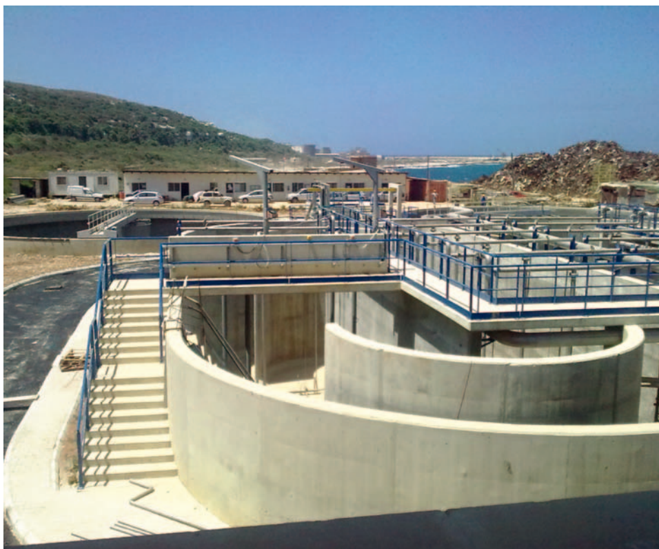
Wastewater installations in the coastal city of Tripoli

The southern section covering Carlton-Al Ghadir collector line, which is under completion costing about US$ 13 million, designed to serve the south western part of Beirut and part of its southern suburb, as well as part of Baabda district and the Damour-Al Ghadir line, executed and amounting to about US$ 9.5 million, through funding by the Islamic Bank, which is designed to serve a major part of Aley district and part of Shouf district (more than 100,000 inhabitants), the length of the