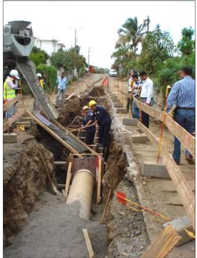
Plate1: Casting of sewerline at the On-going Plaines Wilhems Sewerage Project