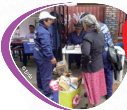
Provision of recyclable waste by residents - Colombia Recycler of metals - Togo Waste transfer station - Vietnam

10 years after the implementation of the 2005 Oudin-Santini Law allowing French local governments to mobilize up to 1% of their water and sanitation budget resources, local authorities now have a mechanism for improving waste management in developing countries.