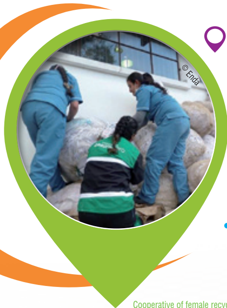
Cooperative of female recyclers, Loma Verde Packaging of recyclable waste for resale - Bogota , Colombia