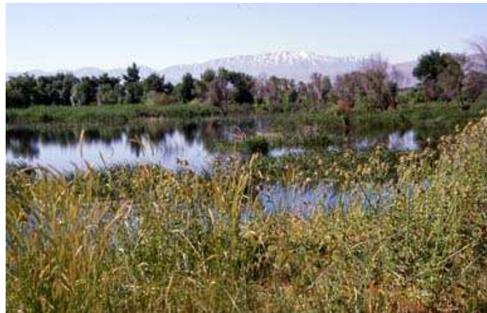
Fig. 2 Looking west across Aammiq Marsh.

Historically the wetland used to cover a large proportion of the Bekaa plain, reaching northwards up to thirty kilometres from its current extent. However, because of the high fertility of the Bekaa soils, parts of the plain have been converted to farmland since ancient times. The last major effort to drain the wetland for agriculture occurred during the 1960s and early 1970s, with the digging of an extensive network of drainage ditches across the plain, and building of levees around the Litani