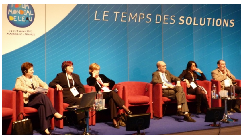
European Trialogue, Thursday March 15th

There are many of us that welcome these achievements and hope their development continues, particularly this year, 2012, designated the European year of water!