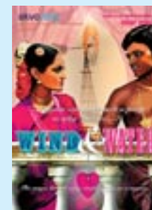
Posters AKVO