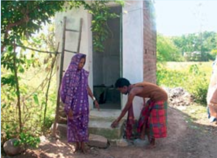
Woman showing toilet construction in Tamil Nadu