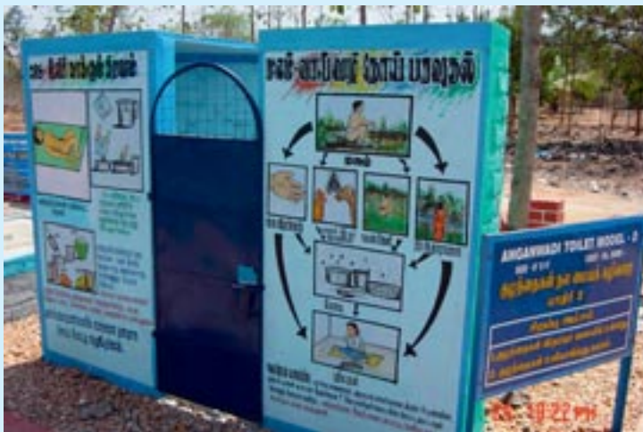
Demonstration toilet in sanitation park in Musiri

The financing mechanisms and products described in this section are more commonly used by these meso-level actors in their design and scope. However, as with the micro-level mechanisms and products, their suitability is determined by the appropriateness of the match between the mechanism / product with the local socio-economic, environmental, political and governance context as well as client needs for finance.