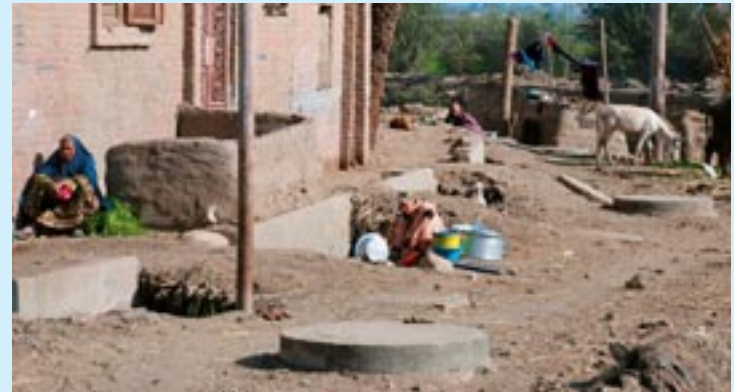
Pilot project Fayoum