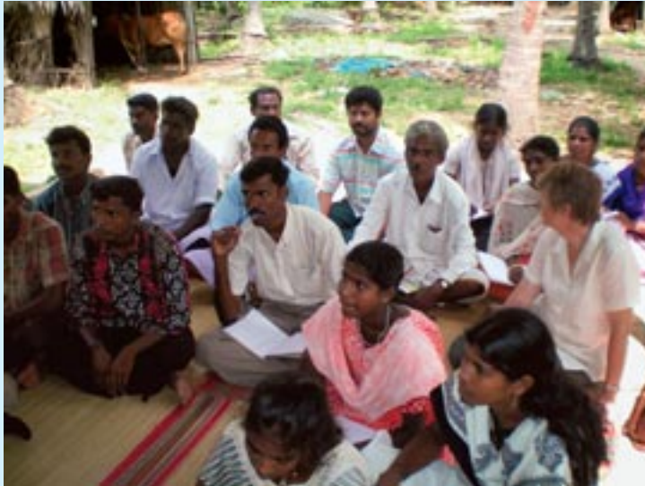
Savings group, India