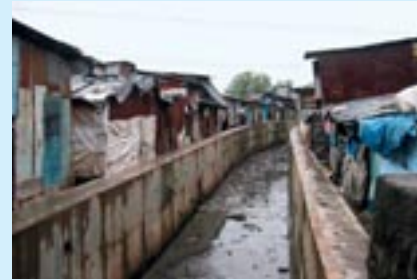
Sewer system, slum Mumbai, India