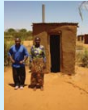
Toilet systems UFUNDIKO