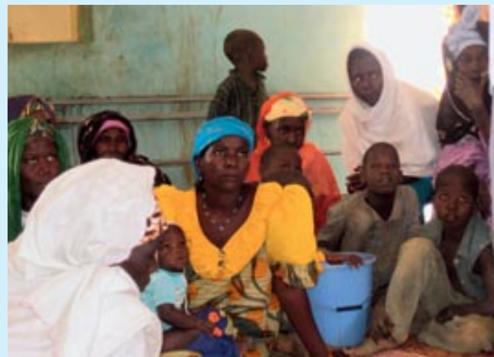
Saving & credit group