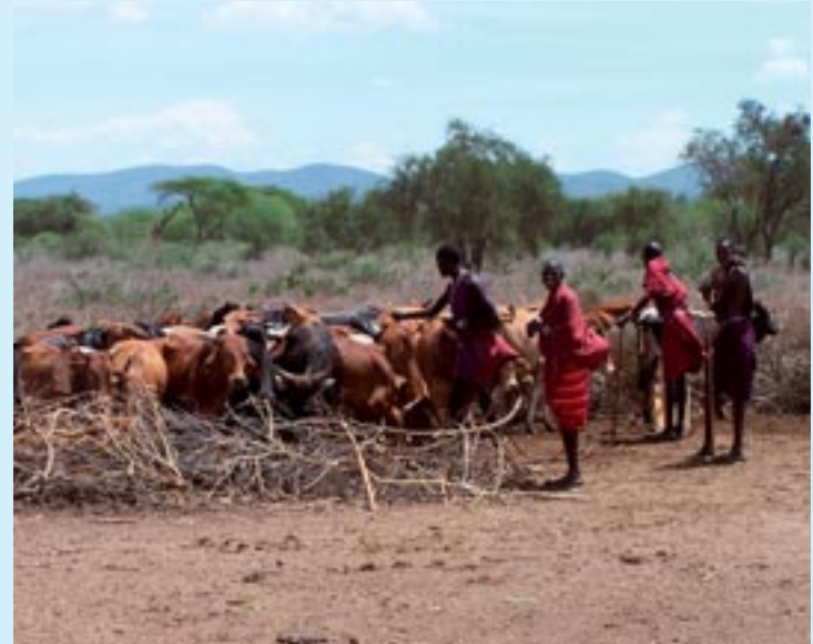
Masai nomads, Kenya