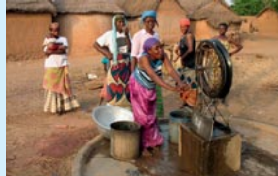
Rope pump Ghana